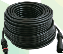
CEC75 75 Ft. Cable