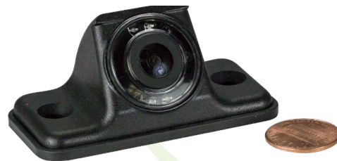
VCMS140iB CMOS Camera