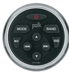
PRC100BC Remote Control