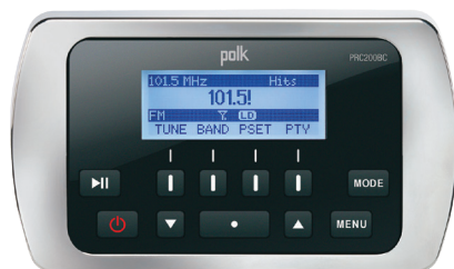
PRC200BC Remote Control