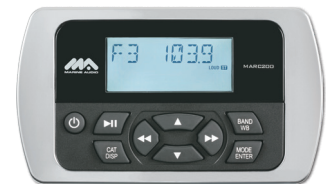
MARC200 Remote Control