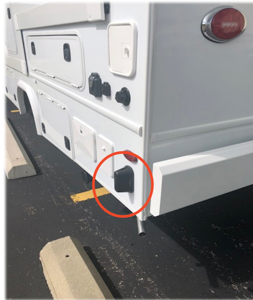
Detection Sensor and Housing