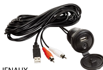
JENAUX USB Interface and 1/8" Auxilliary Input (required to use USB and AUX inputs)