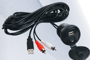
Optional USB and 1/8" AUX input interface cable