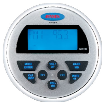
Optional JWR200 Wired Remote