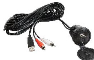
Optional USB Interface & 1/8" Auxiliary Input

ASAelectronics. THE MOBILE ELECTRONICS COMPANY SINCE 1977 2602 Marina Drive • Elkhart, IN 46514 www.asaelectronics.com