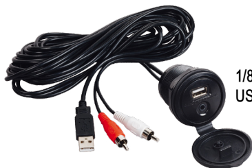
1/8" Auxiliary Input & USB Interface (optional)

ASAElectronics THE MOBILE ELECTRONICS COMPANY SINCE 1977 2602 Marina Drive • Elkhart, IN 46514 www.asaelectronics.com