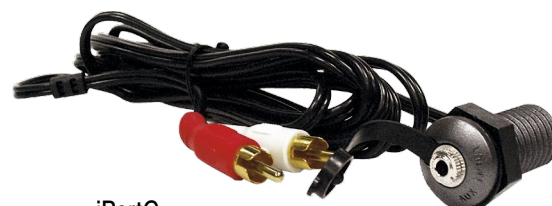
jPortG JENSEN 1/8" Auxiliary Input Jack connects MP3 player

ASAelectronics THE MOBILE ELECTRONICS COMPANY SINCE 1977 2602 Marina Drive • Elkhart, IN 46514 www.asaelectronics.com