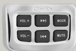
JHDHBC Handlebar Remote Control