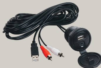
USB and 1/8" AUX input interface cable