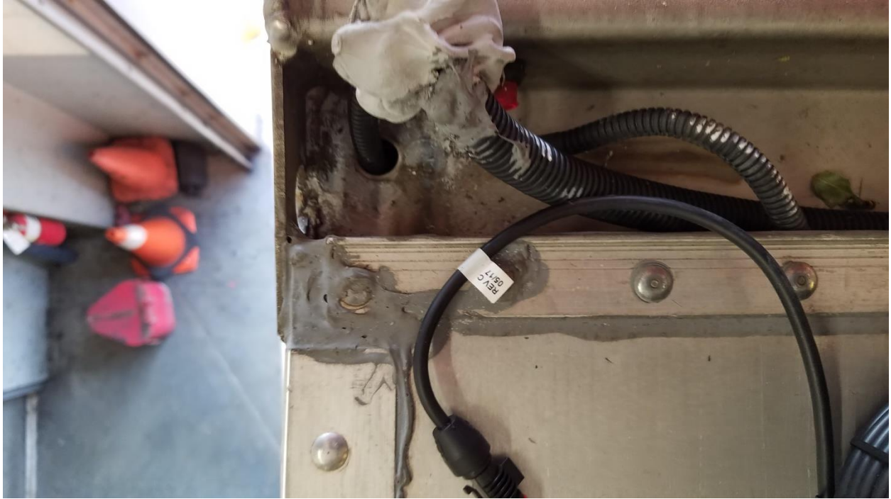
Underneath the Trailer at Pillar: